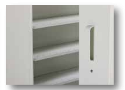
Freetrack 2 is effortlessly moved using an attractive handle. All units have the option to be lockable for added security.