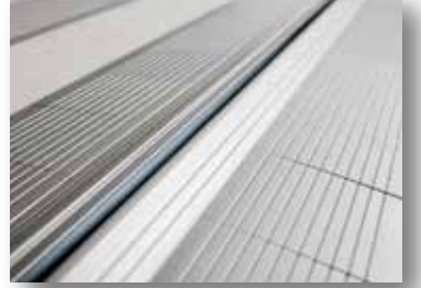
Stylish and sleek track system with ramps provides easy access to shelving bays.