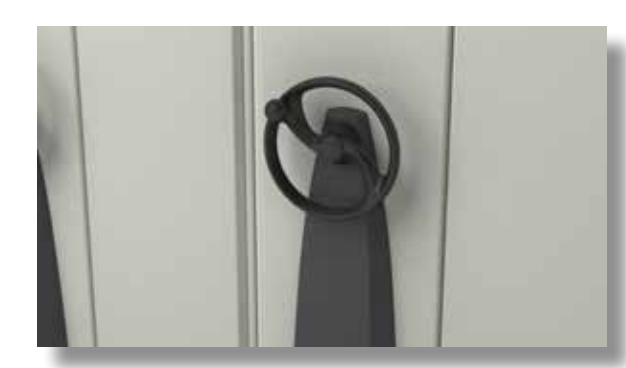
The Mekdrive 3 hand-wheel can be retro-fitted to Mekdrive 1 and 2 systems with a simple modification.