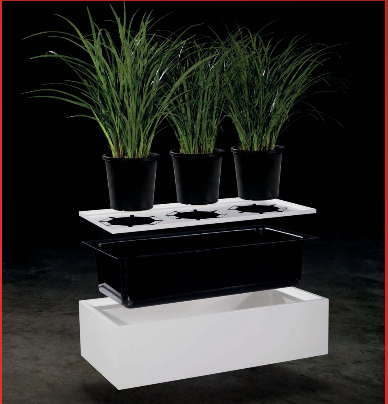
The Strata 2 planters have been designed to work together with the entire suite of Strata 2 cabinets. The modular design accommodates all plant types, and ensures easy maintenance and care.