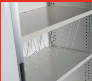
Suspended wire rack.