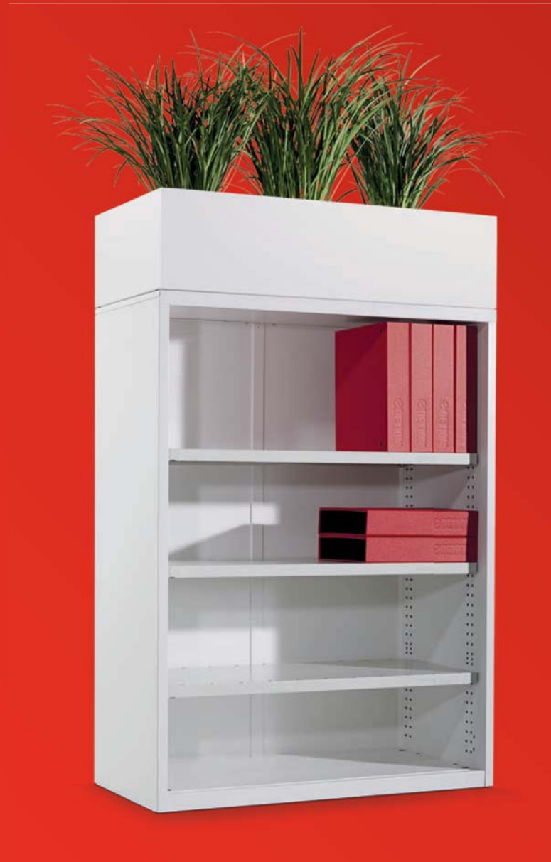
No door (Bookcase)