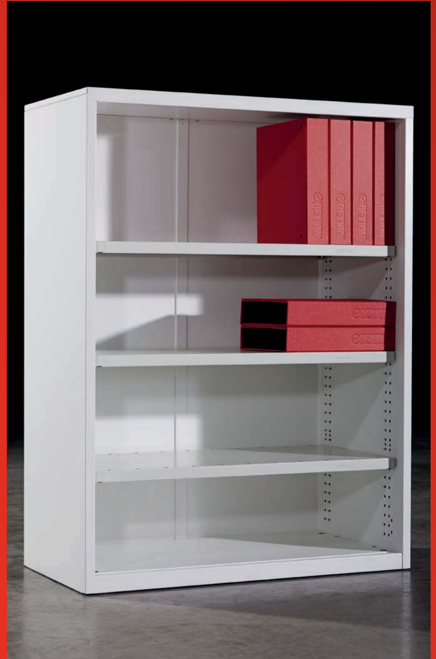
Without doors, bookcase.