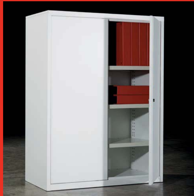
With doors, swing door cabinet.