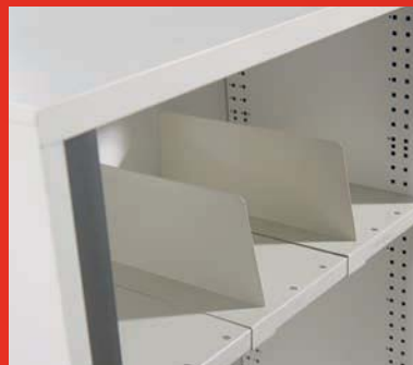
Shelf dividers clip-on.