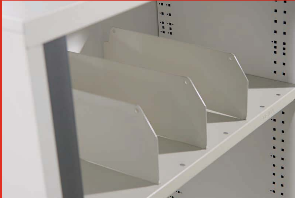
Slotted shelf dividers.