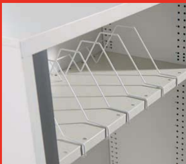
Wrap around wire rack.