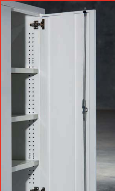
Lockable doors provide extra security for sensitive documents.