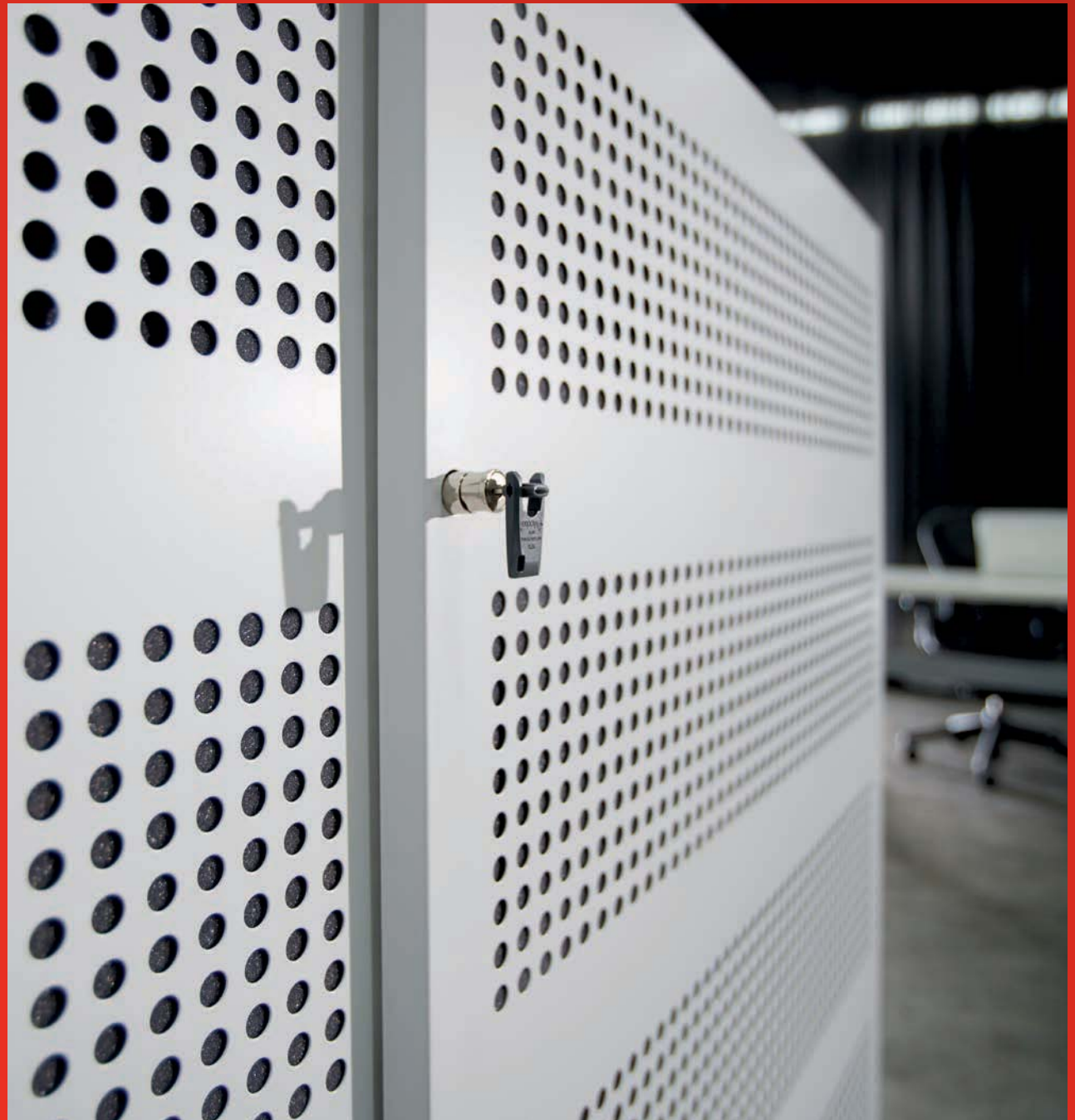
Perforated doors with acoustic sound absorption panels create a modern aesthetic and enhanced sound absorption.