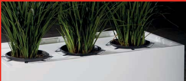
Plain planter, designed to achieve maximum strength and rigidity.