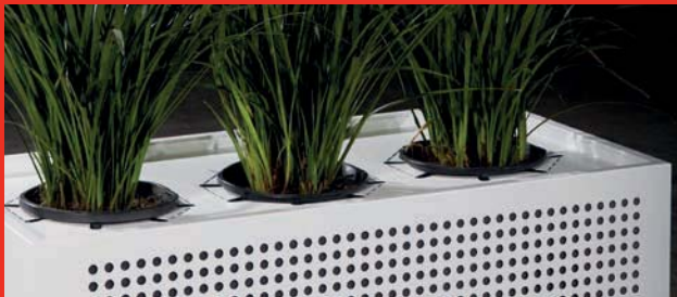
Perforated planter, provides acoustic dampening.