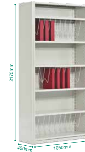
Suspended filing racks for lever arch binders.