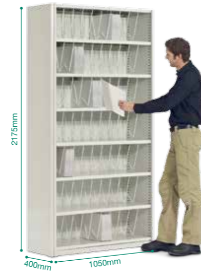
Suspended filing racks for lateral shelf filing.