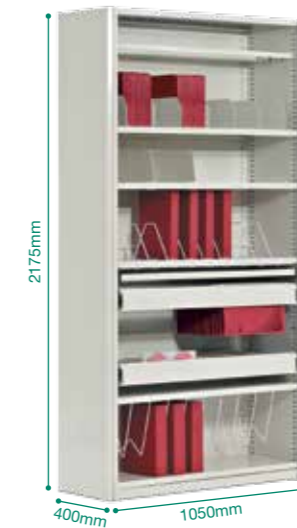
Fully accessorised Ultima CI-80.