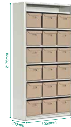
Ultima CI-80 archive solution.