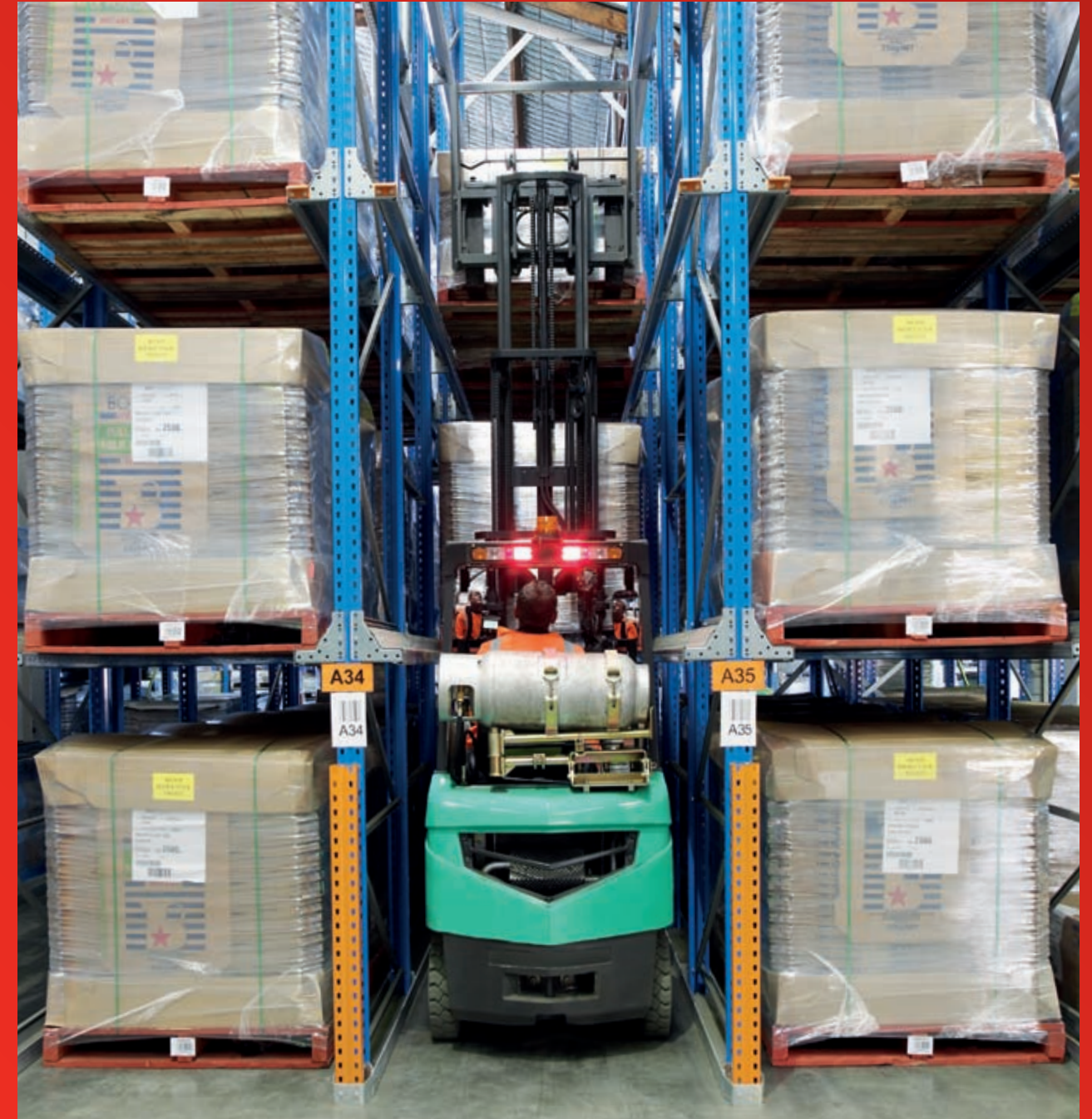
Handling equipment can drive right into the centre of the block between any upright on the front face to pick up pallets. Safety plays an important part in both initial design and installation allowing forklift operators to safely enter the structure.