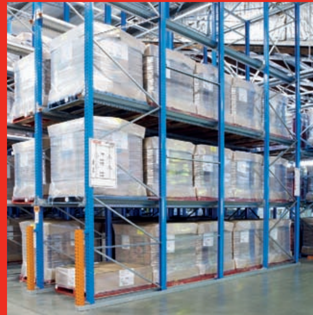
Each pallet sits on its own rails, so pallets no longer need to be stacked on top of each other.