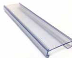
Shelf Label holders